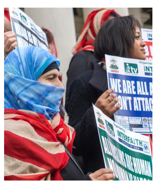
Written by: Larry Zuvillaga

In the aftermath of the September 11th attacks, hate crimes against Muslim Americans skyrocketed growing from 28 such incidents after 2000 to 481 in 2001. The 9/11 attacks shifted public opinion and encouraged prejudices that would be perpetuated via legislation and aggressive rhetoric for years to come.